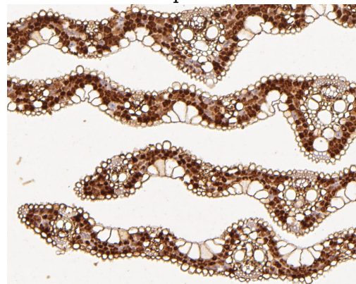
Fig2:: Immunohistochemical analysis of paraffin-embedded rice tissue using anti-JAZ11 antibody. The section was pre-treated using heat mediated antigen retrieval with sodium citrate buffer (pH 6.0) for 20 minutes. The tissues were blocked in 5% BSA for 30 minutes at room temperature, washed with ddH 2 O and PBS, and then probed with the primary antibody (1/50) for 30 minutes at room temperature. The detection was performed using an HRP conjugated compact polymer system. DAB was used as the chromogen. Tissues were counterstained with hematoxylin and

Fig1:: Immunofluorescence staining of paraffin-embedded rice tissue using anti-JAZ11 rabbit polyclonal antibody. The section was pre-treated using heat mediated antigen retrieval with Tris-EDTA buffer (pH 9.0) for 20 minutes. The tissues were blocked in 10% negative goat serum for 1 hour at room temperature, washed with PBS, and then probed with JAZ11 antibody at 1/50 dilution for 10 hours at 4°C and detected using Alexa Fluor® 488 conjugate-Goat anti-Rabbit IgG (H+L) Secondary Antibody at a dilution of 1:500 for 1 hour at room temperature.