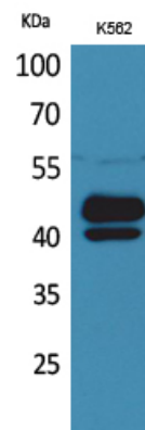
Fig1:: Western Blot analysis of K562 cells using PSG1 Polyclonal Antibody.. Secondary antibody [catalog#: HA1001) was diluted at 1:20000